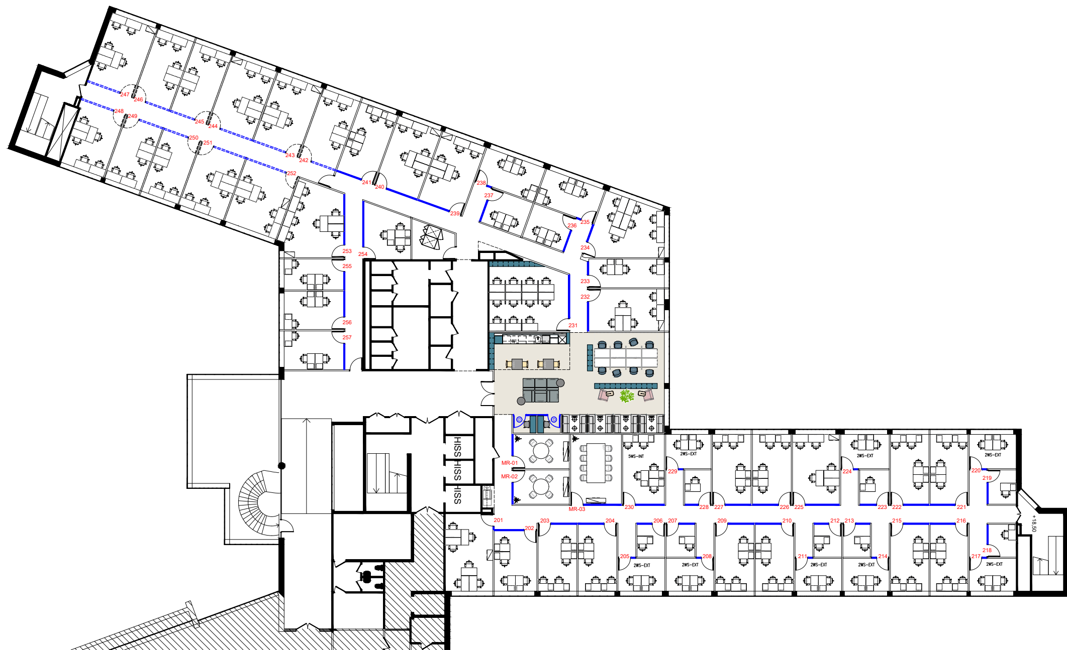
2ND LEVEL FLOOR PLAN